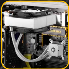
Support for various liquid cooling radiator sizes