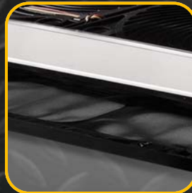
Exterior access to main filter for easy maintenance