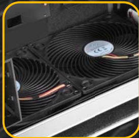
Two Air Penetrator fans included for great performance and quietness