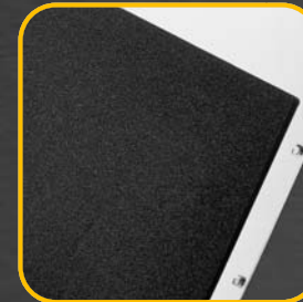
Foam padded interior for advanced noise absorption