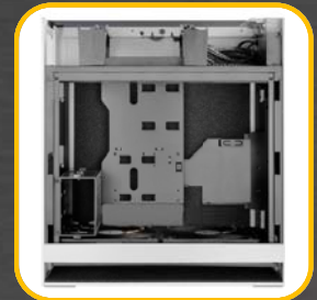
Revolutionary 90 degree motherboard mounting from RAVEN RV01