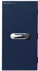
Blue Ocean series