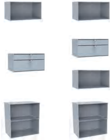
Model MP 100