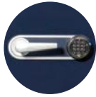
Ergonomically Designed Handle for Easy Use