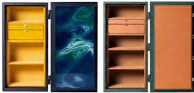
Model MP 100