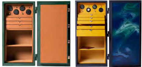
Model MP 120