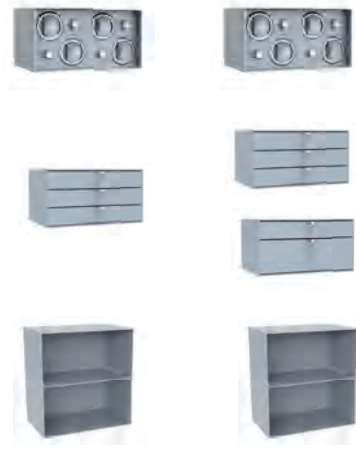
Model MP 100