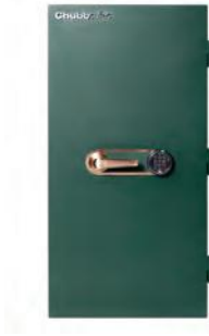
Green Forest series