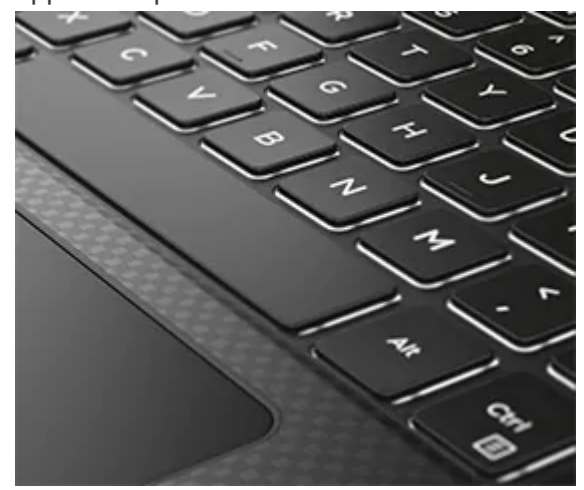
See what you've been missing

Work or play all day: You'll experience the longest battery life of any 15-inch* laptop —up to 20 ½ hours* on a Full HD model with 97Whr battery when using when using productivity applications like Word or Excel or up to 14 ½ hours* when streaming Netflix. On our UHD panel, get up to 13 hours and 22 minutes* using productivity apps or up to 9 hours and 22 minutes* of Netflix streaming and with OLED get up to 10 hours and 24 minutes* on productivity apps and up to 9 hours and 23 minutes* of Netflix streaming.