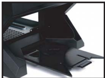
Removable power supply fan filter