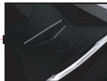
Top mounted power and reset buttons