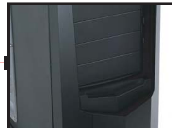
Elegant matte-finished front door