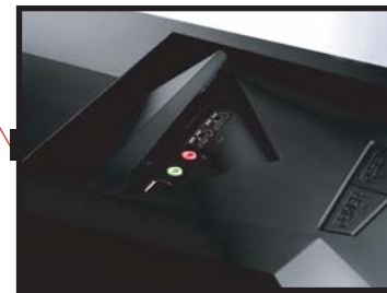
Top mounted stealth front I/O ports