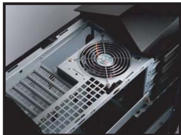
Top 120mm exhaust fan tuned for quietness