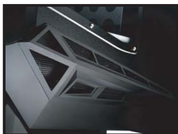
Side panel intake vents