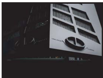
Twin knobs locking system for top panel cover